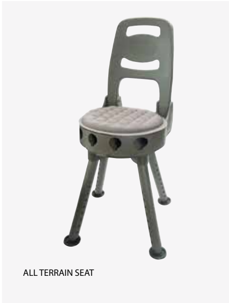
ALL TERRAIN SEAT