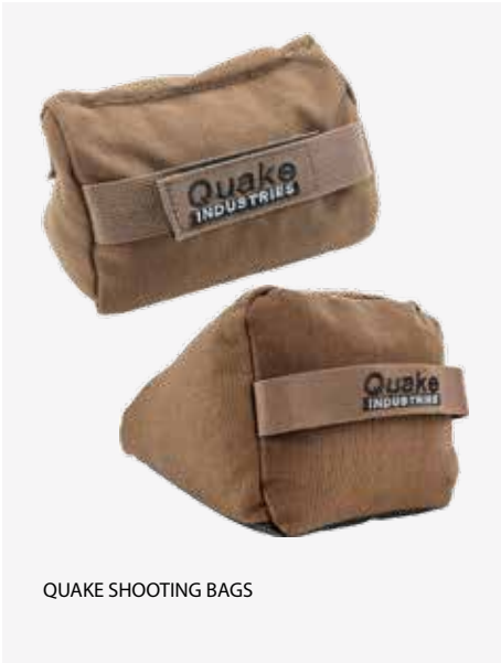
QUAKE SHOOTING BAGS