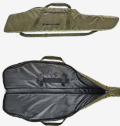
BERGARA SOFT RIFLE GUNCASE

Visit your local dealer or bergara.dikarcoop.com for the full accessories catalog or scan the QR code besides and get a 10% free in your first order