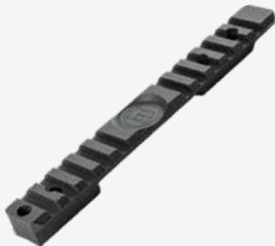
BERGARA 0 MOA, 20 MOA, 30 MOA RAIL