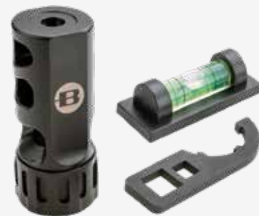
ST1 MUZZLE BRAKE (SELF TIMING)