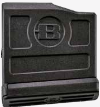
BERGARA AICS COMPATIBLE