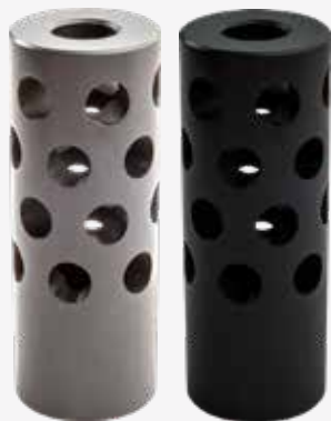
OMNI MUZZLE BRAKE