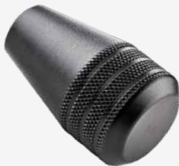
TACTICAL BOLT KNOB FOR B-14 SERIES